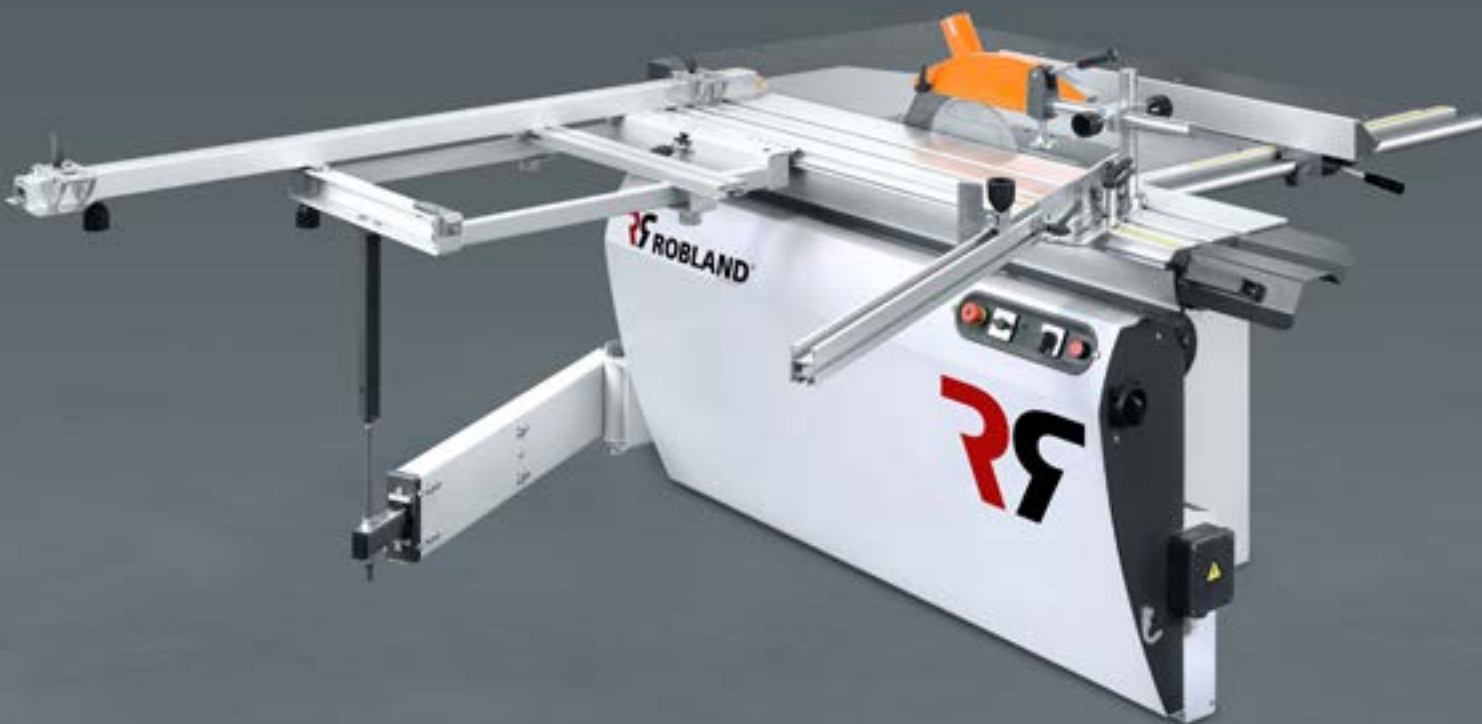
NXZ with options